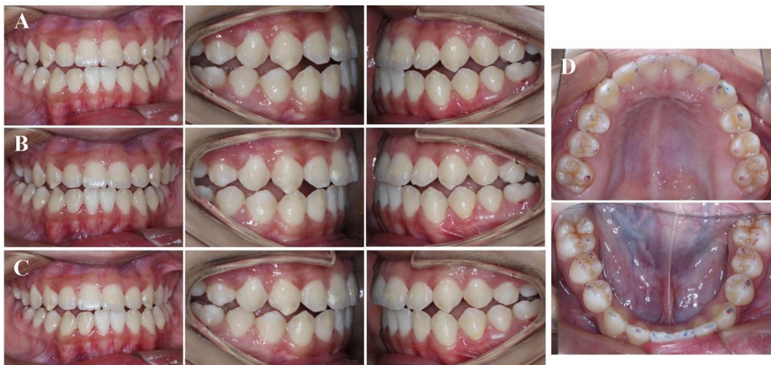
Figure S3. Assessment of functional occlusion:(A) protrusive movement. (B) right excursive movement. (C) left excursive movement. (D)occlusal marks; red: centric contact, blue: protrusive and lateral excursive movements of the mandible.